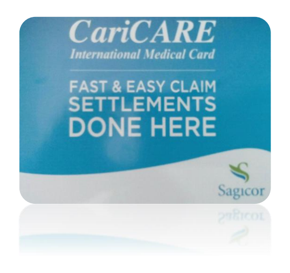
Illustration 2 CariCARECARD